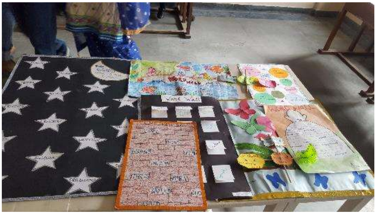
Learning new words, sharing new words!