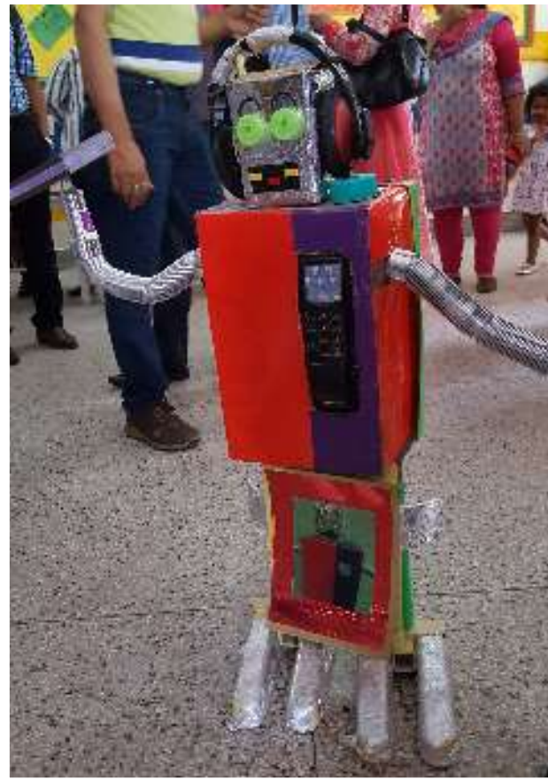
The cool android!