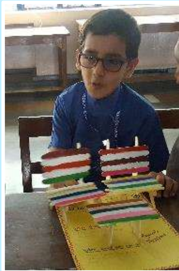
Colourful, and useful, all at once!