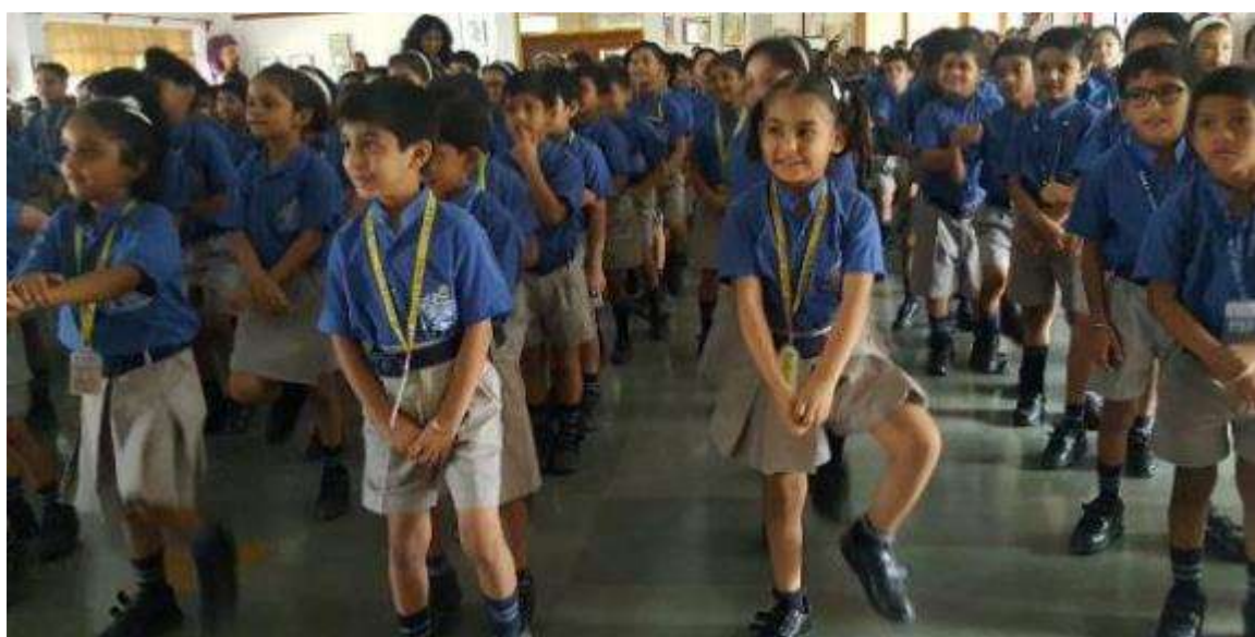
Zumba session: grooving to “Oppa Gangnam Style?!”