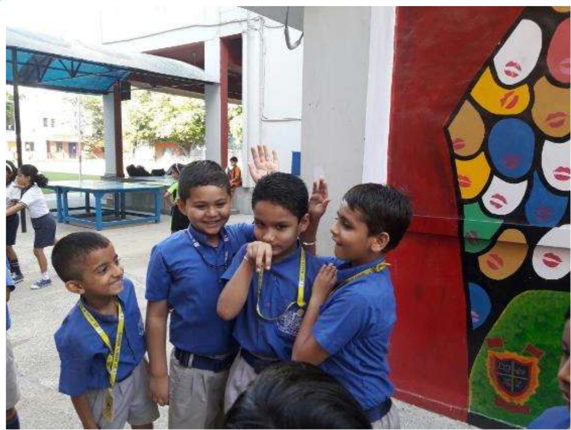
Creating the cutest bunnies, together!