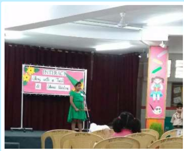
Making stories come alive!