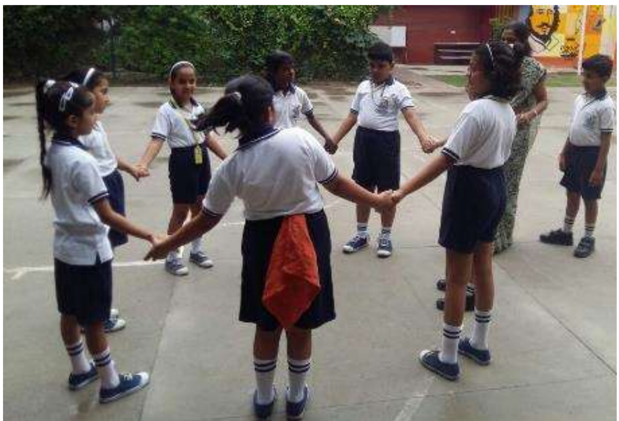
The monkey's mighty tail, and the dutiful team members!

The first ice breaker was filled with action and oodles of fun! Each class was broken up into small teams, and each team was given the task of protecting each other! And what better way to initiate it than to take recourse to the animal kingdom? Each team had a fox, and a monkey with a tail. While the fox chased the monkey's tail with single minded determination, the team worked hard at keeping their monkey friend safe! The ice-breaker activity was a raging success! It broke the inertia of the summer holidays, and helped the students re-create solidarity, all at once!