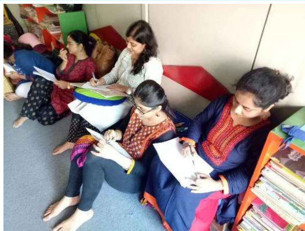
Scribbling away at our unique mandalas!