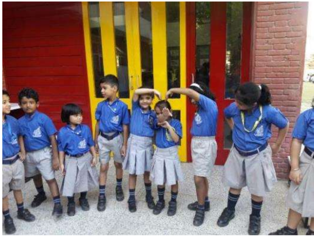
Behold the elephant's mighty trunk!