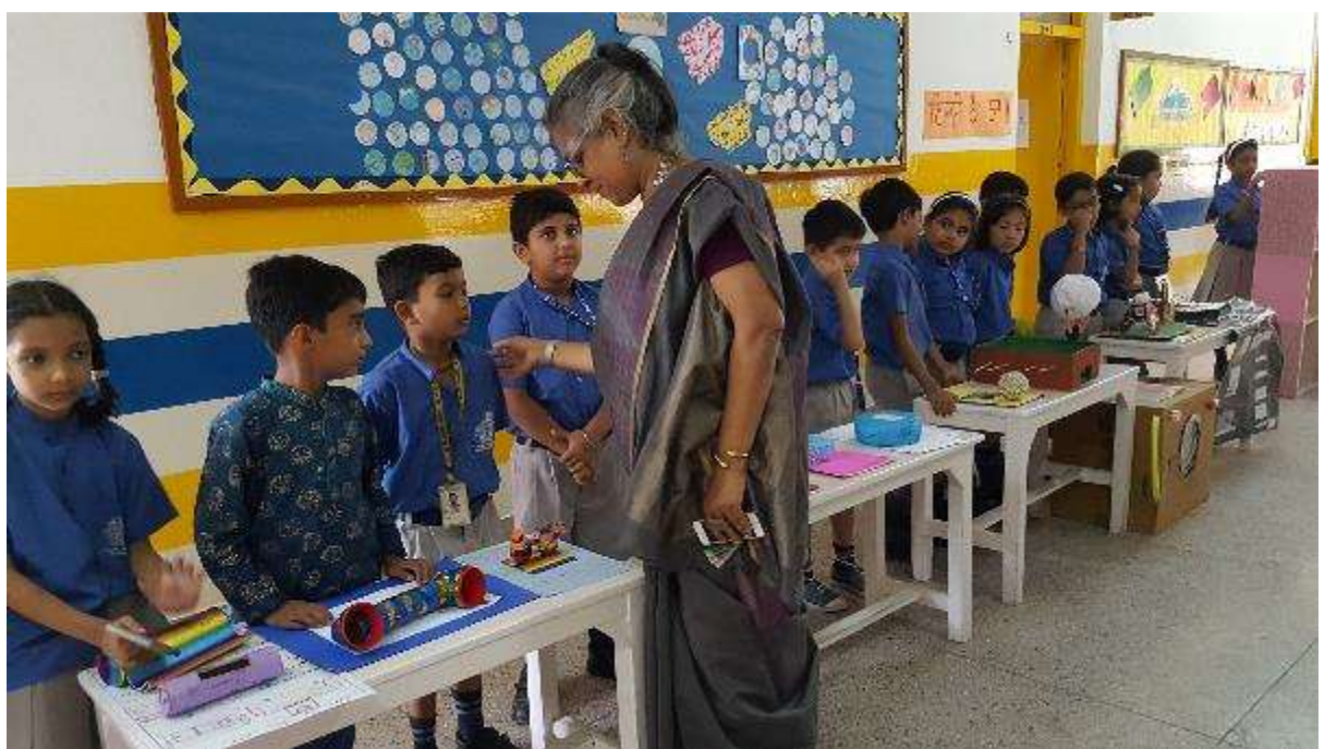
Words of praise and encouragement from our Principal!