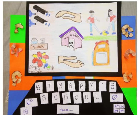
3. Varda Arora-Class 6 th