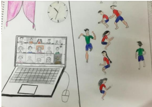
4. Kaashvi-Class 5 th