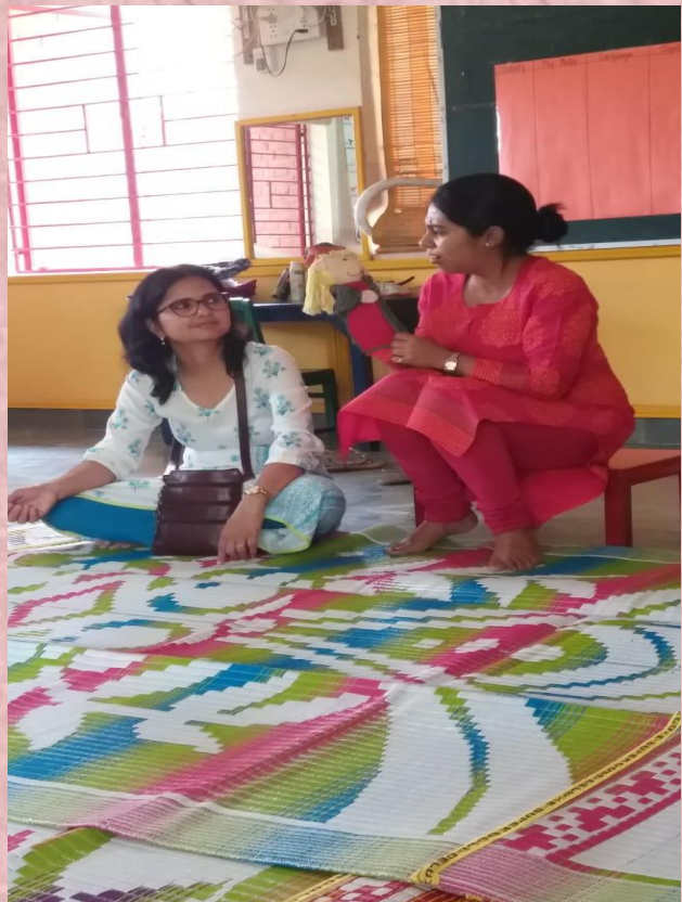
The adorable talking object impressed us.