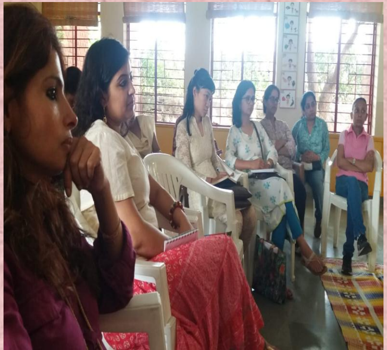
A learning environment for teachers