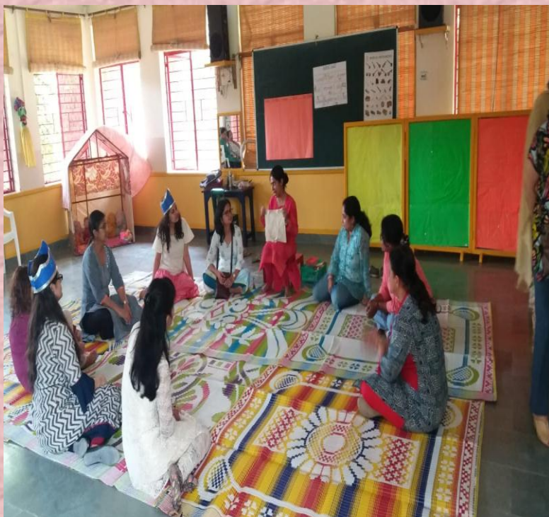
Beginning with circle time