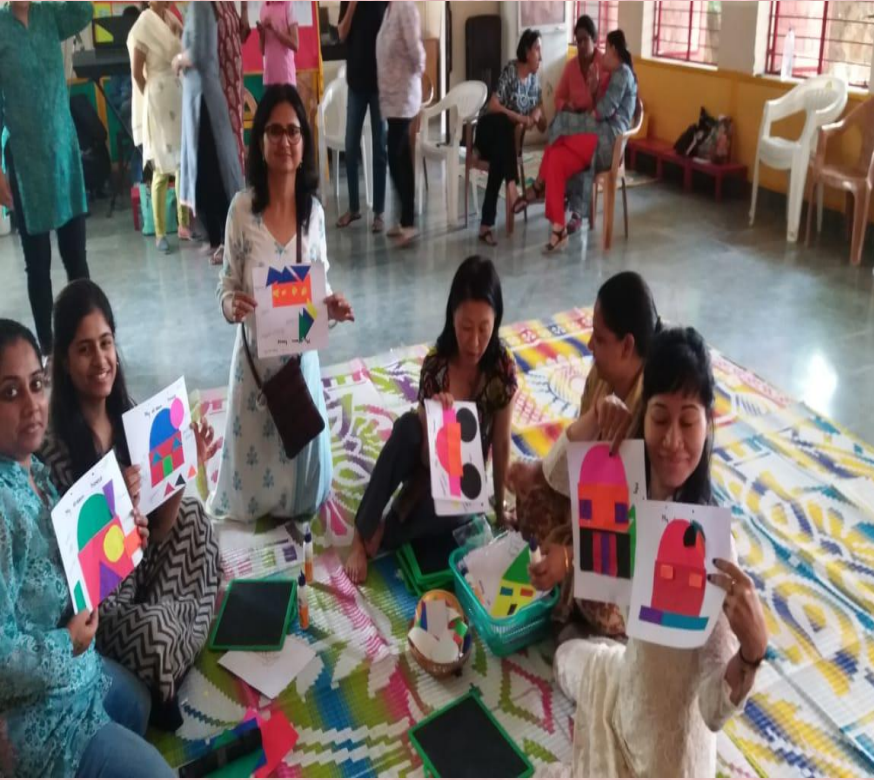
Follow-up exercise- My dream home