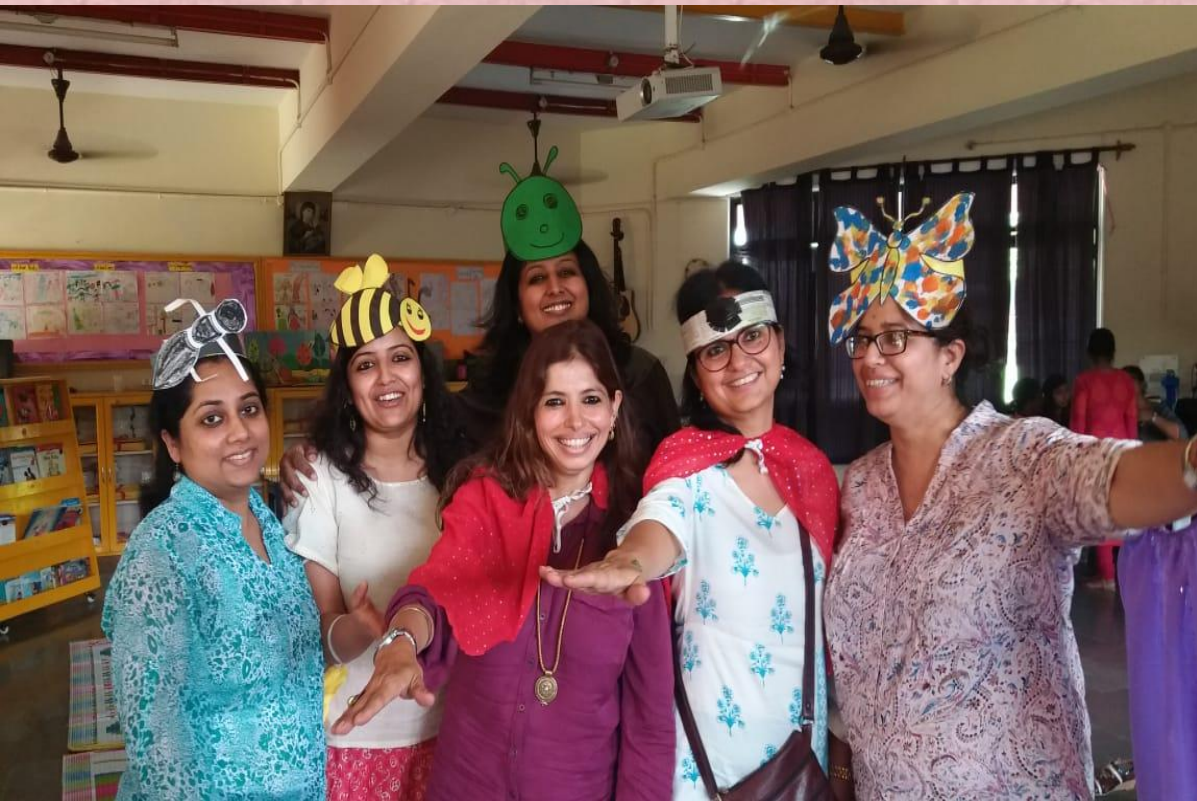
Dramatic play on the story "Little Nanhi ant lost her way"