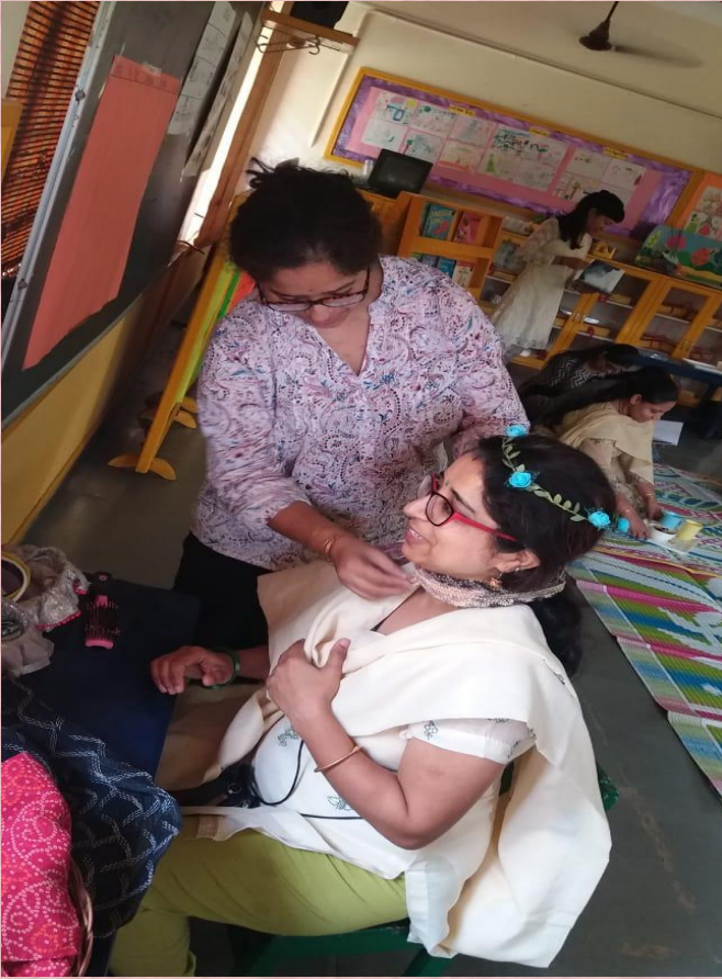
Pretend play – let's dress up