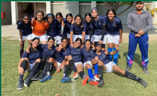
U19 Girls Football Zonals - GOLD MEDALISTS

In the silent chaos of avoiding conflict but wanting that land, there is an uneasy halt to things until an official from the State comes up and divides the neighbourhood among the two groups. The small guys are unhappy about losing "their home" and make attempts to gain what they lost. The big guys in their fear of losing "their home" and being mightier, strive to gain more.