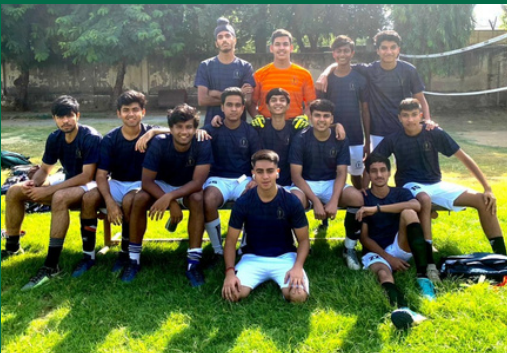
U19 Football Boys Zonals - QUARTER FINALISTS