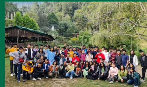
Class X- Trip to Mussoorie