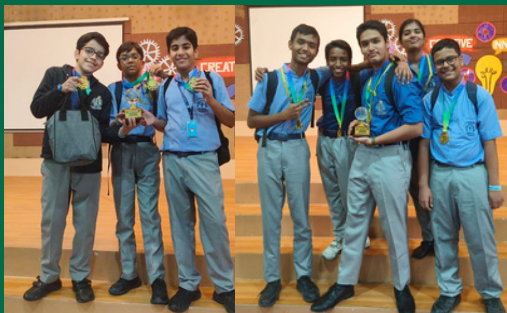
1st position overall in K.R. Mangalam Interschool 'Hands On Minds On' Competition