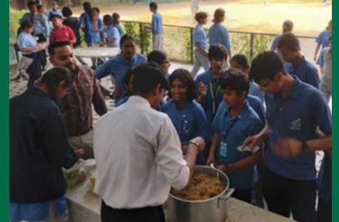
Fundraiser Organized by the Citizen Empowerment Department