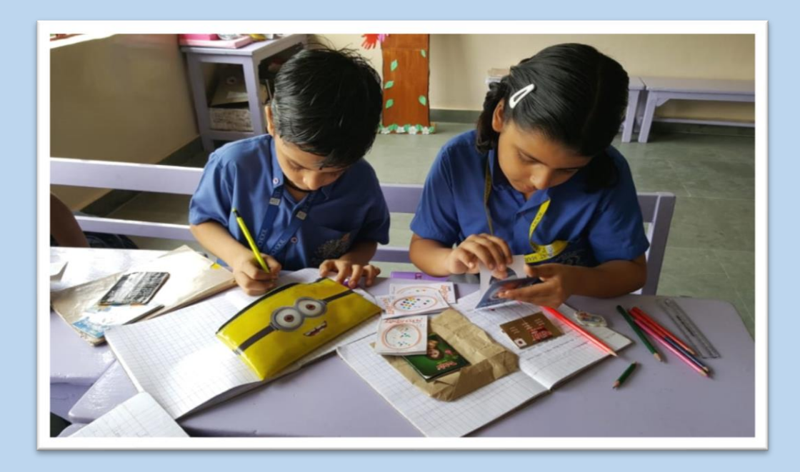
Bindi activity -learning Abacus