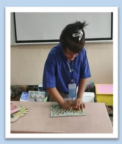
Tiger - the feisty cat!!

This was highlighted in the Holiday H.W showcasing which had "gone wild!" Each student took pride in presenting and sharing their treasure of knowledge with the parents and friends.