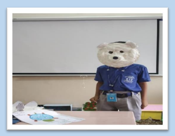
The Polar Bear from the Artic