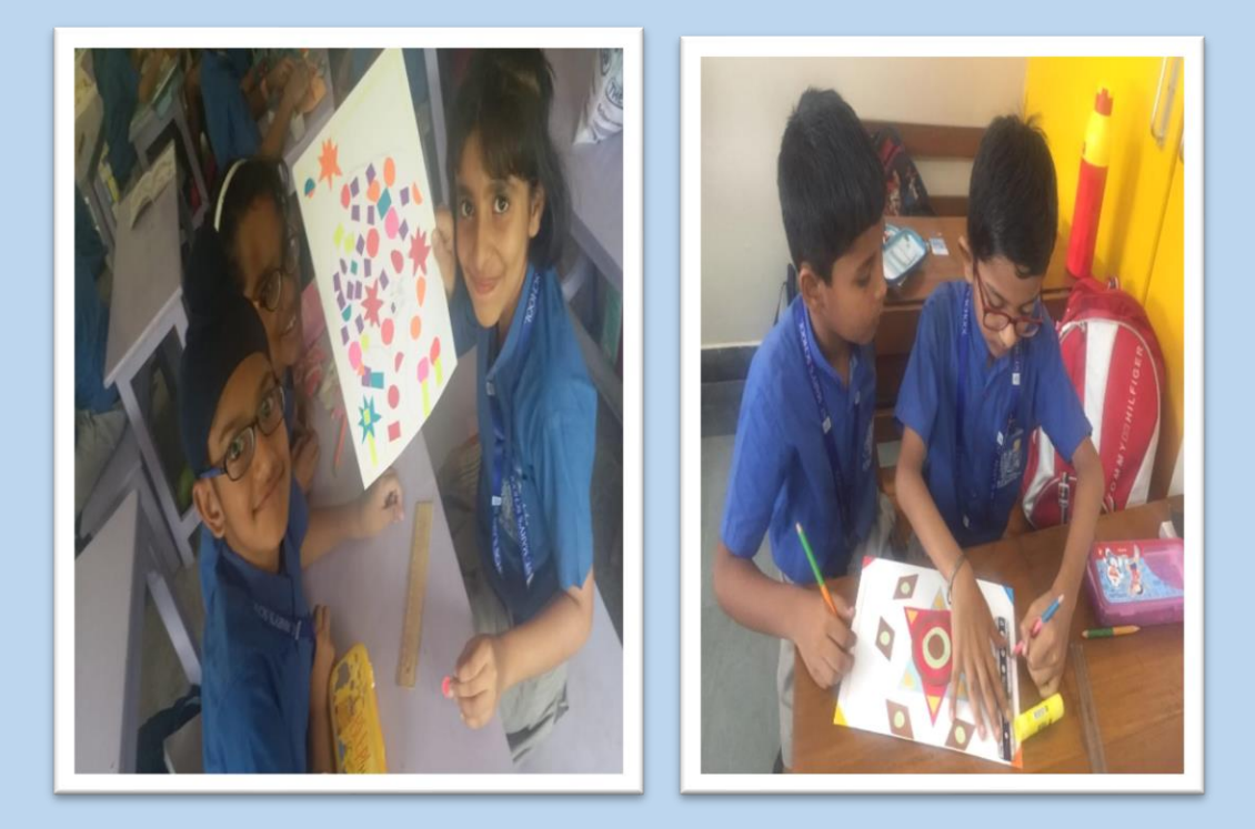
Patterns by class 3

Mountains to cars, clouds to trees, patterns all were geometrically aligned. The observation. Identifying shapes, creativity and team work were evident.