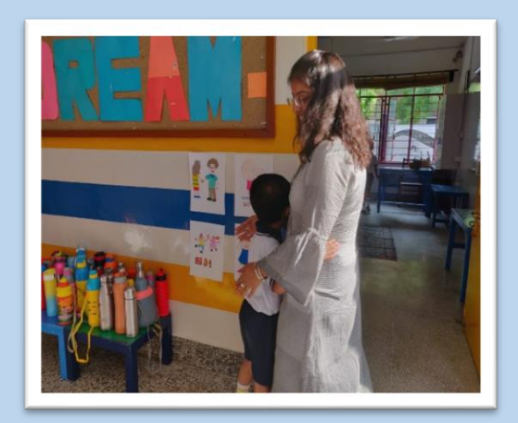
My Little Hugsy <3