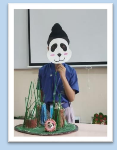
In danger...so endangered...

The classrooms came alive with the woes and cries of the endangered animals and the students were sensitive to the rapidly declining animals on Earth. The role of human beings in the endangering of animals was brought to spotlight. The aware and sensitive generation surely holds a chance for the wiping out of animals from the planet.